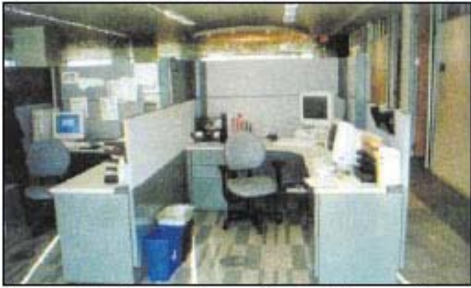
Figure 2 : Open plan office with one floor diffuser per workstation